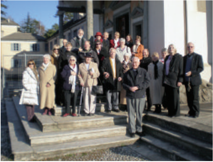
“Set your hearts on His Kingdom” (Pilgrims to S. Monte Calvario, Domodossola)